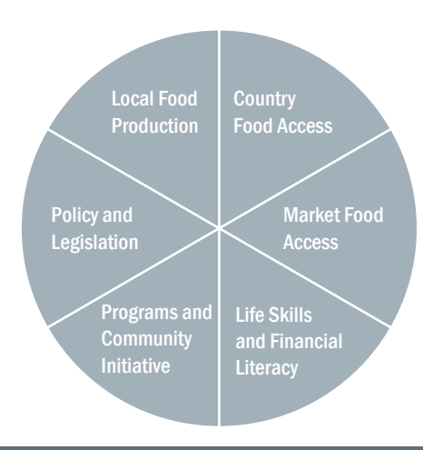
\textbf{Figure 1.} \ \textbf{The Nunavut Food Security Coalition's six food security themes.}

Informed by the poverty reduction public engagement process and the strategy development process, the Coalition identified six themes around which the Nunavut Food Security Strategy would be centered (Figure 1).